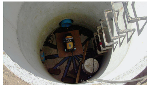
sewer rehab + inspection