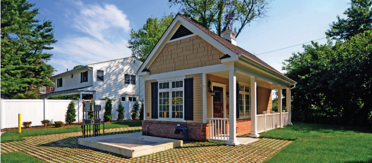
pump stations + upgrades