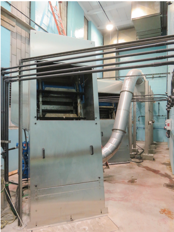
new bar screens