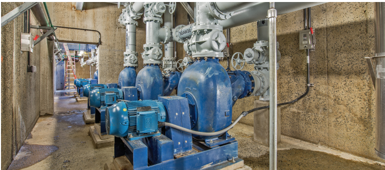
existing pumps upgrade