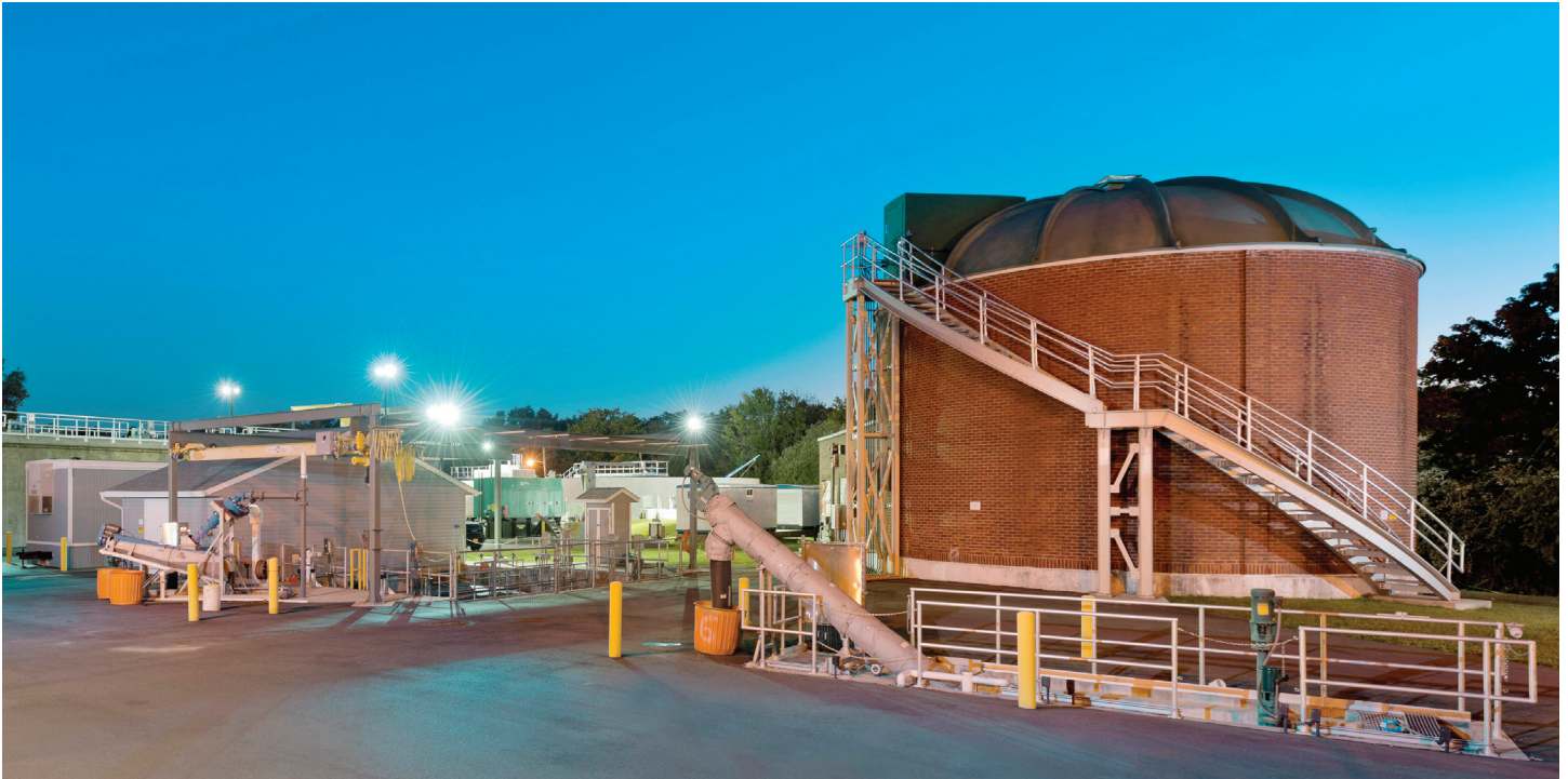
water resource recovery facility

H2M's team of seasoned professionals continues to develop pioneering solutions that reduce the cost of wastewater infrastructure projects. For clients dealing with issues related to nitrogen removal, rehabilitation or updating aging infrastructure for regulatory compliance, resiliency concerns, new septic to sewer sanitary collection systems for the elimination of on-site/failing septic systems, impacts of developments and system expansions, H2M's experienced leadership in the wastewater field make us ideally suited to resolve challenges on all levels.