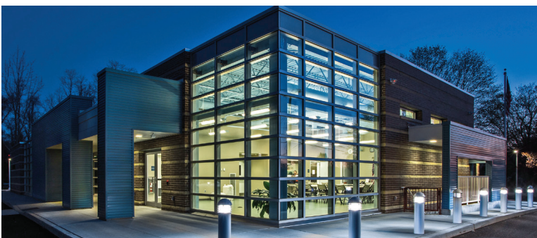
integrated sustainable design