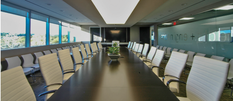
energy modeling/energy analysis