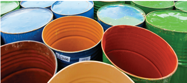
hazardous material management